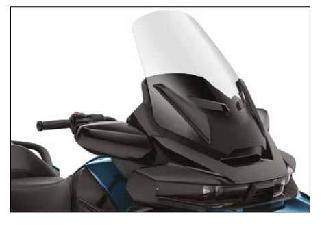
ADJUSTABLE ELECTRIC WINDSHIELD The adjustable electric windshield with memory function provides superior wind protection and the memory function automatically returns the windshield to the lowest or previous height.