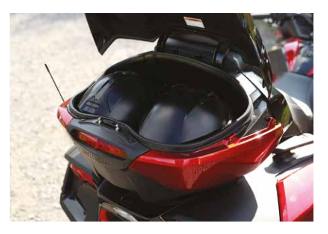
Ling COMPATIBLE TOP CASE Conveniently bring whatever you need with the extremely roomy 60 L (16 gal) rear top case that contributes to an astounding 177 L (47 gal) of storage.*

* Driver backrest not available on this model