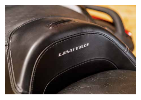
ULTRA COMFORTABLE HEATED SEATS Riders and passengers stay warm with ultra comfortable heated seats.